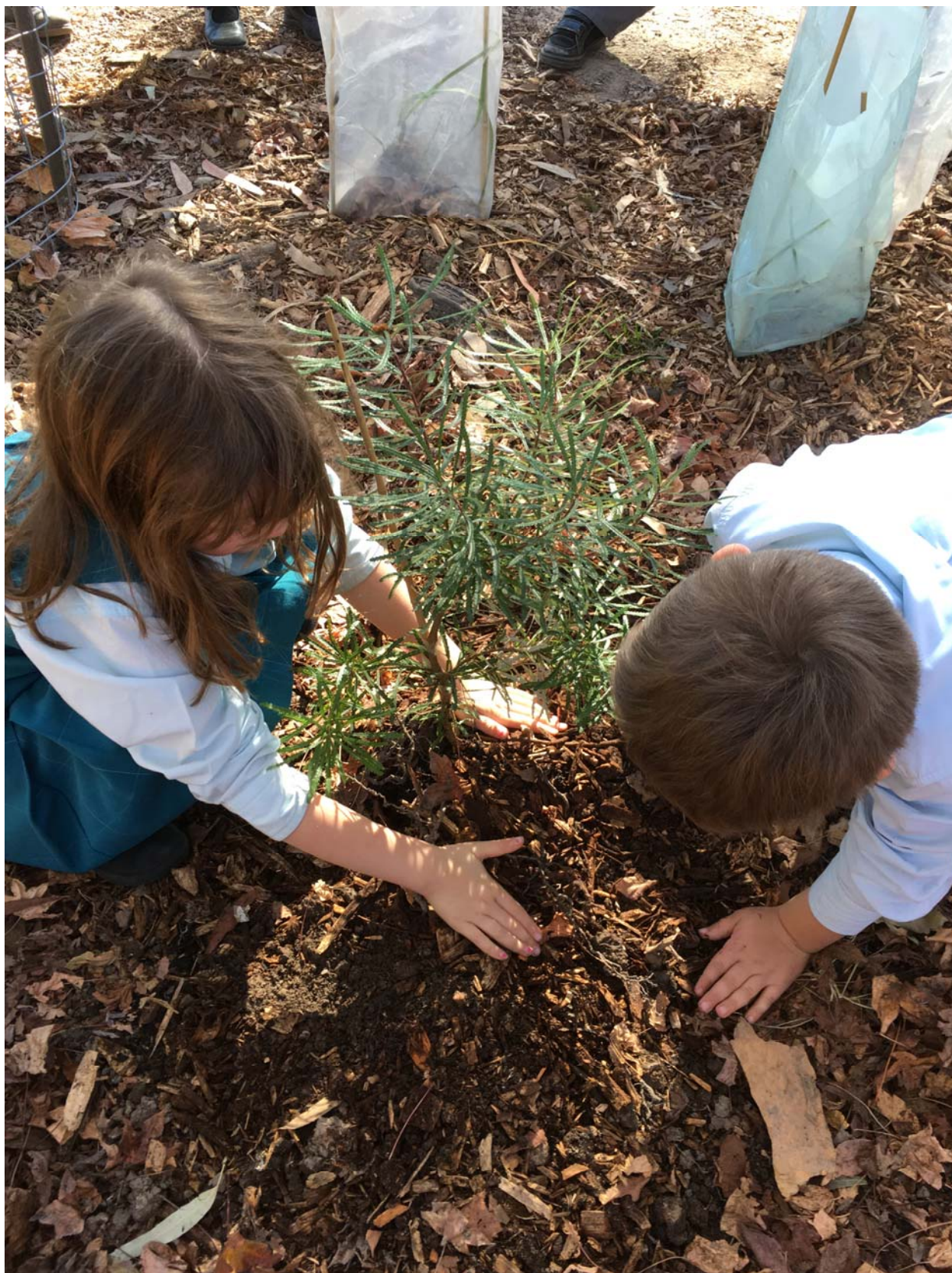
“Planting trees that will grow as we grow” – quote from a 2017 Kindergarten student.