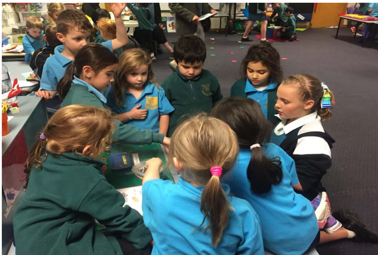
Year 6 helpers assist with group activities