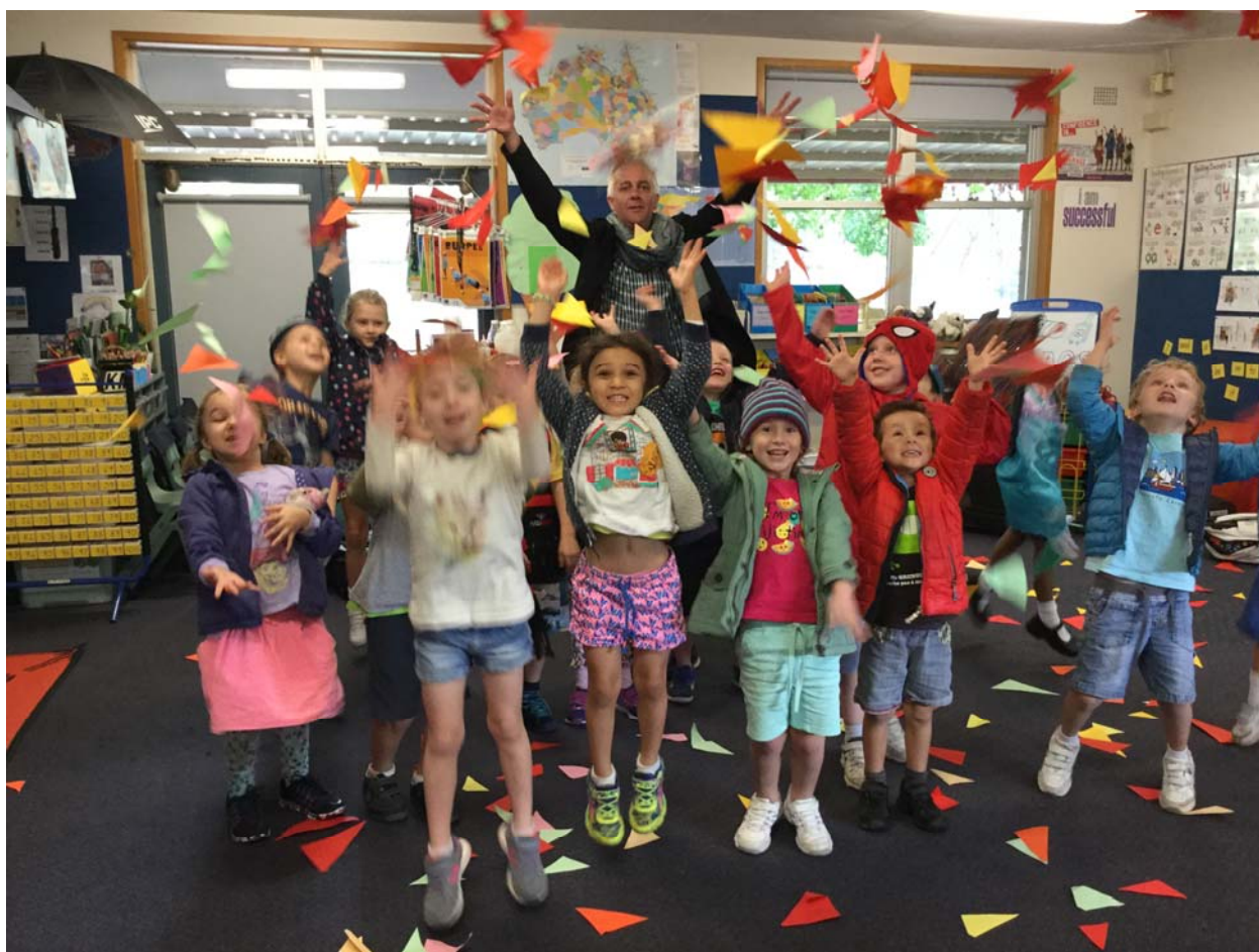
Kindergarten Seasons – Autumn Experience