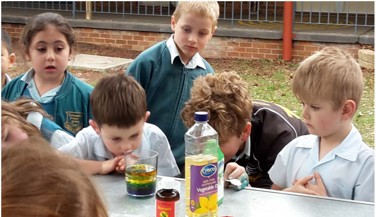
Science Shed Experiments