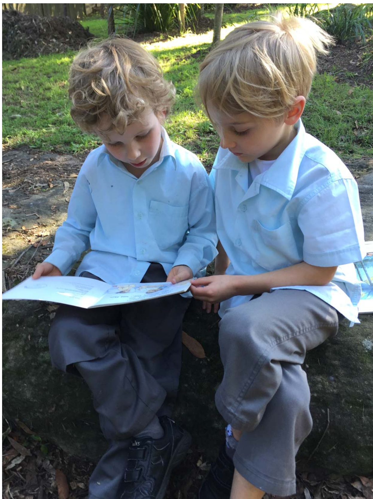
A Class Buddy activity in “Amaroo” – our Outdoor Learning Area.