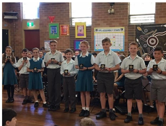
Our Medal Winners