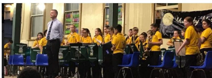
Combined Bands at Music by Moonlight 2019: