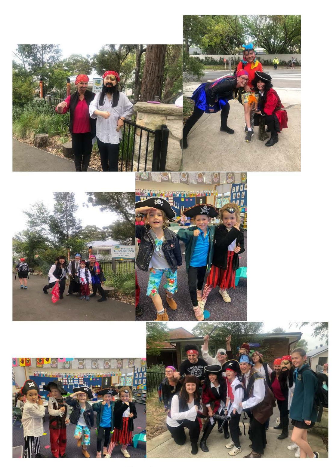
Talk Like A Pirate Day