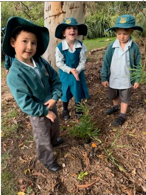
Our Kindy's planting a Banksia