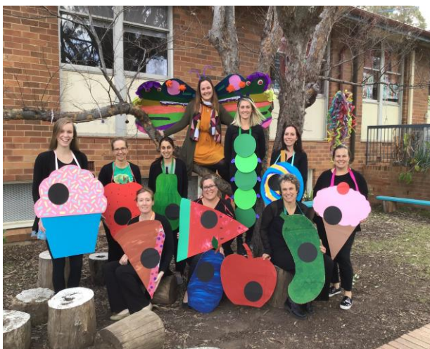
The Very Hungry Caterpillar!