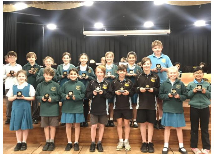
Our Medal Award Winners