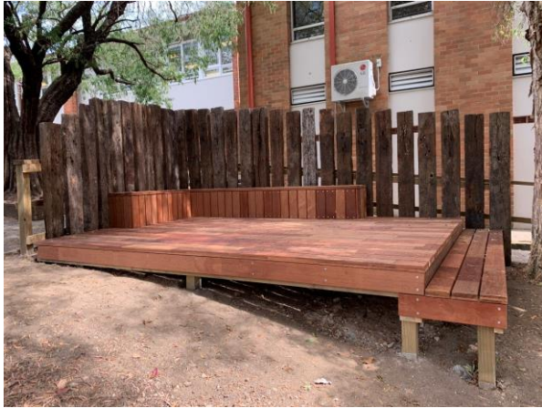
Year 6 space finished in the holidays. (stage 1)

We also had a small area constructed for Year 6 to use which they are already enjoying