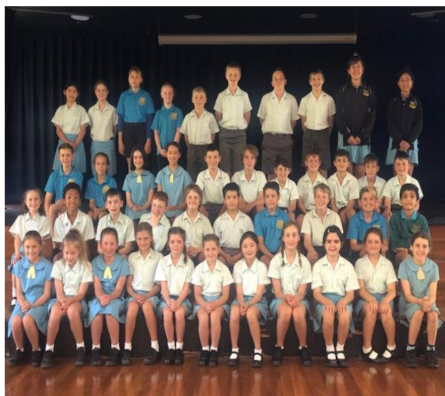
Well Done to our Medal Recipients