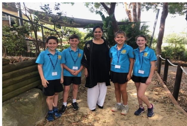
Year 5's with Christine Anu.