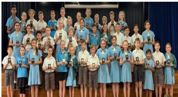
Term 4 Medal Winners.

5A were the winners of the Assembly Award for Semester 2 and will receive their reward in Week 9. They have been very consistent in Assembly always being respectful and trying each week to be their very best.